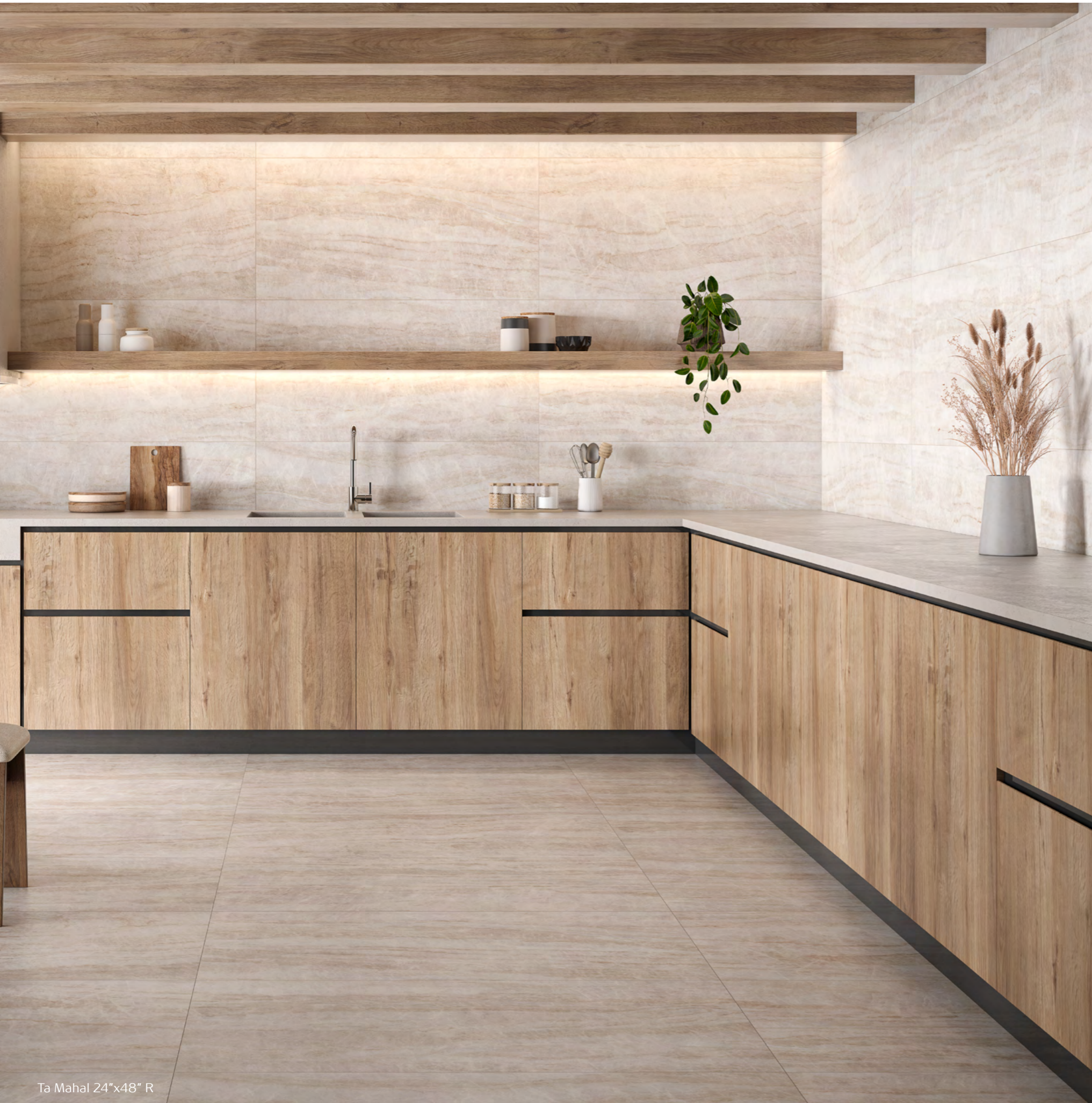
Taj Mahal 24"x48" R

The Taj Mahal porcelain tile is inspired by the sophistication and beauty of the natural stone of the same name, known for its warm tones and soft textures. It features a surface with shades ranging from light beige to soft gold, with organic veins that flow delicately, giving it a natural and elegant appearance. Ideal for creating warm and sophisticated environments, this porcelain tile combines the refined aesthetic of Taj Mahal quartzite with the durability and practicality of porcelain, making it perfect for floors, walls, and areas that require a touch of exclusivity.